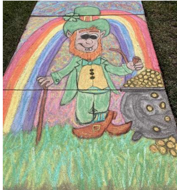
Top of the mornin' to ya!