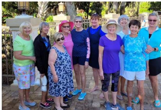
Celebrating a Birthday at Water Aer-