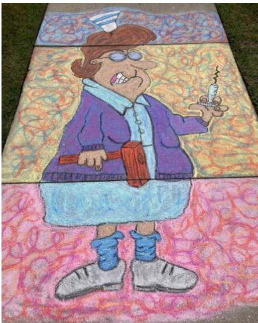
One down one to go...